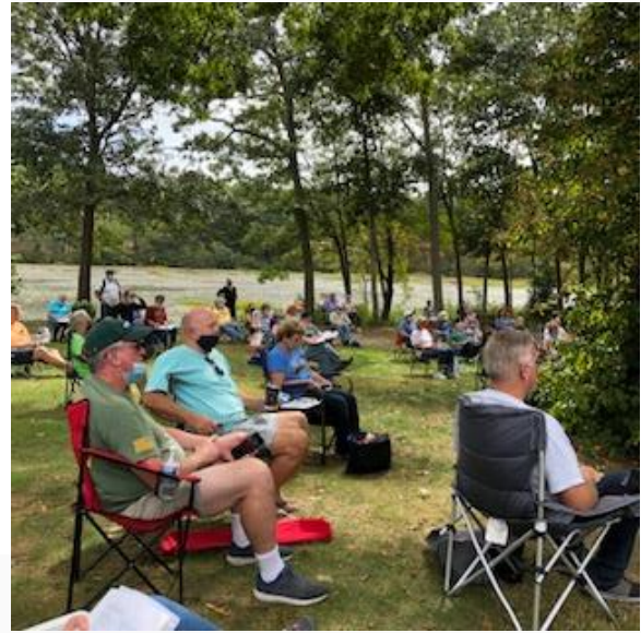
Many masked members paying close attention to the speakers in such a beautiful setting.