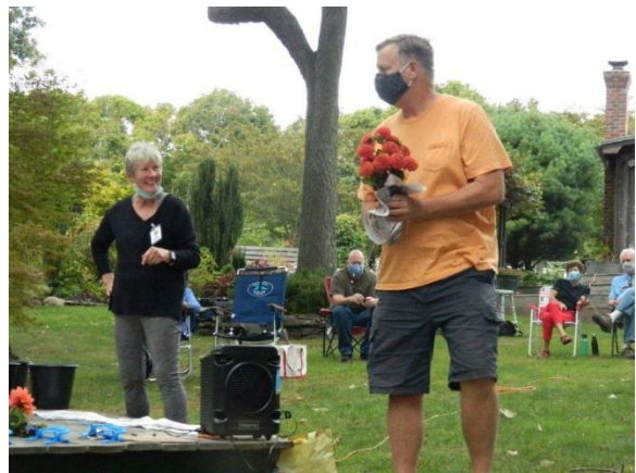
Beautiful Dahlias were donated and given out as some of the door prizes.