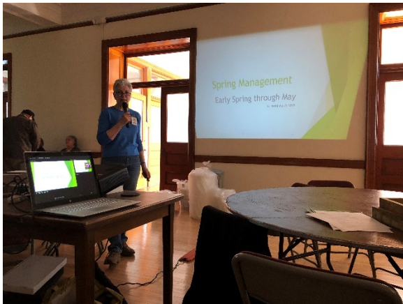
Grace and Beekeeping 101