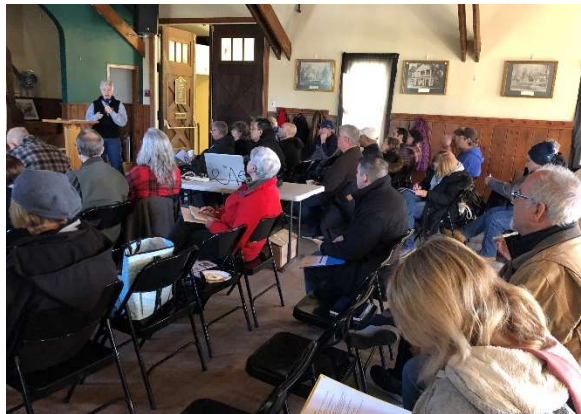
A full class again. Great job!